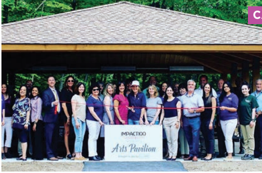
CAMP MORTY PAVILION