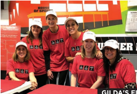
GILDA'S FIT FEST