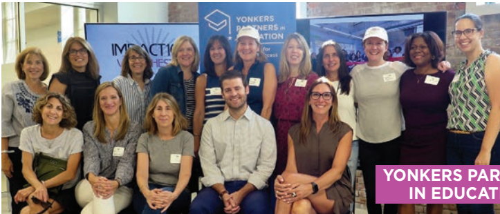
YONKERS PARTNERS IN EDUCATION

"The extent to which the Arts Pavilion achieved its projected outcomes was evident in the experience of our campers. This summer at Camp Morty, we hosted 478 campers, which is the most campers that we have had enrolled over the past 5 years. The pavilion was used daily in activities ranging from dance, arts & crafts, friendly competition games, and more."