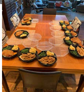
Left: Thanksgiving meals: CRC