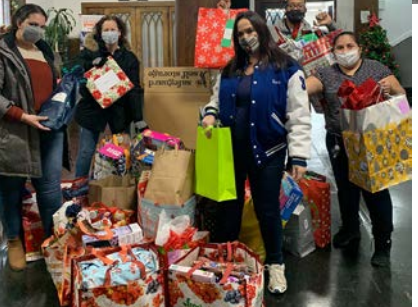
Right: YWCA of Yonkers holiday gifts