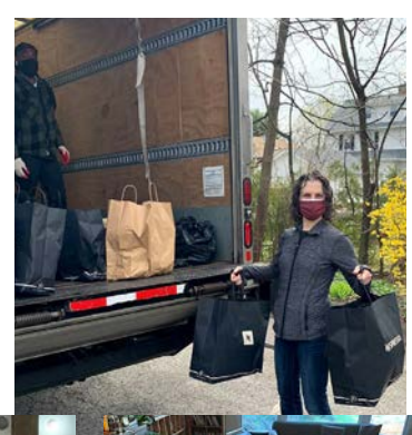
Left: BBBS clothing drive