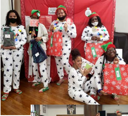
Above: YWCA of Yonkers PEARL program