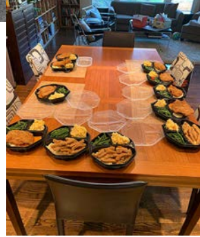
Left: Thanks- giving meals: CRC