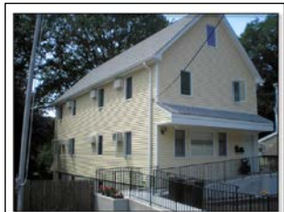
Two SHORE-built family rental apartments • 2010 Saw Mill Road, Ardsley Home to two single-parent families, total of four children