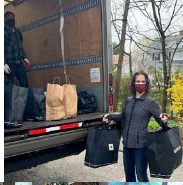
Left: BBBS clothing drive