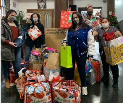
Right: YWCA of Yonkers holiday gifts