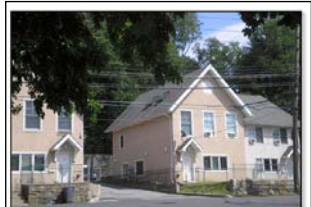
SHORE-built four family rentals and four owner apartments • 2002 West Post Road, White Plains Home to eight families, total of four children