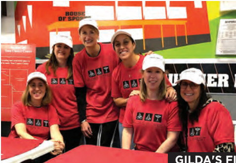
GILDA'S FIT FEST