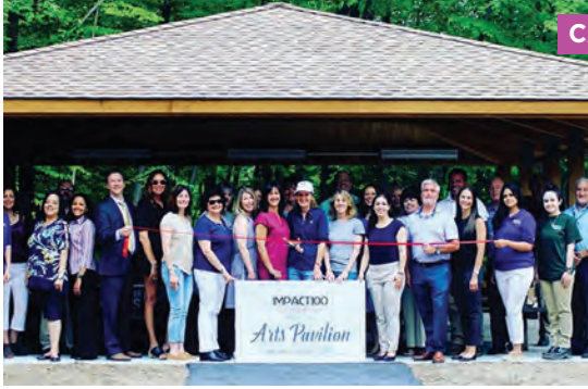
CAMP MORTY PAVILION