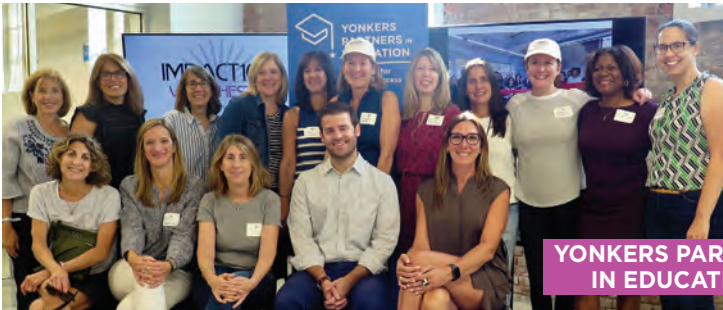
YONKERS PARTNERS IN EDUCATION

"The extent to which the Arts Pavilion achieved its projected outcomes was evident in the experience of our campers. This summer at Camp Morty, we hosted 478 campers, which is the most campers that we have had enrolled over the past 5 years. The pavilion was used daily in activities ranging from dance, arts & crafts, friendly competition games, and more."