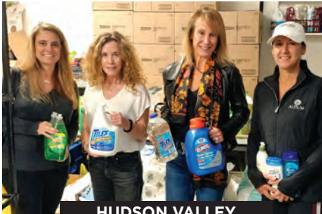
HUDSON VALLEY COMMUNITY SERVICES