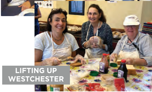
LIFTING UP WESTCHESTER