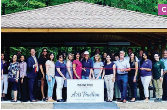
CAMP MORTY PAVILION