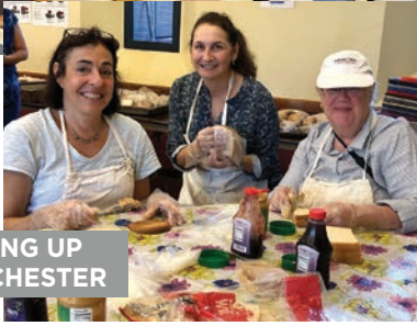
LIFTING UP WESTCHESTER

Pathways to Self Sufficiency. The Pathways Program has three prongs— Housing Retention, Vocational & Employment and Life Skills. Each client placed in housing receives case management services to ensure they maintain their housing and stay healthy. Thanks to our grant, LUW continued to seek additional funding and has received $10,000 from Wells Fargo, $5,000 from Key Bank and $9,500 from the City of White Plains to support their Housing Retention Specialist. SO LOOK WHAT WE HAVE STARTED!