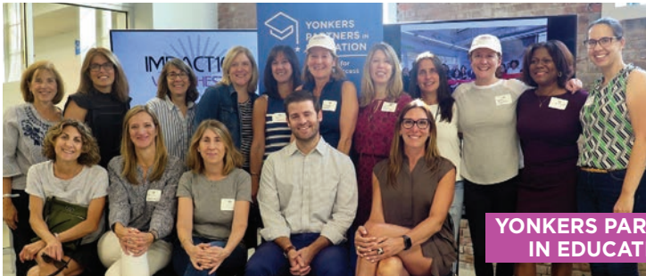
YONKERS PARTNERS IN EDUCATION

"The extent to which the Arts Pavilion achieved its projected outcomes was evident in the experience of our campers. This summer at Camp Morty, we hosted 478 campers, which is the most campers that we have had enrolled over the past 5 years. The pavilion was used daily in activities ranging from dance, arts & crafts, friendly competition games, and more."