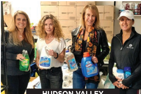
HUDSON VALLEY COMMUNITY SERVICES