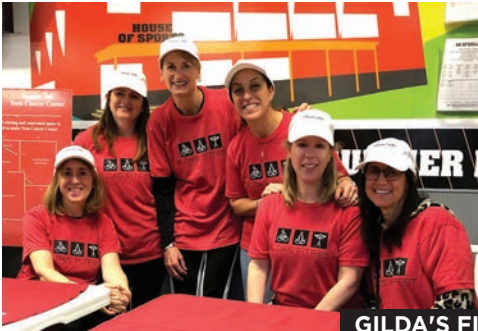
GILDA'S FIT FEST